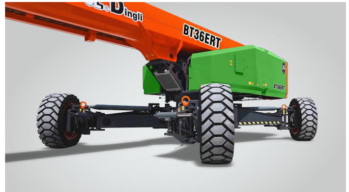
Brand New One-Key In-Situ Axle Expansion Technology Global Patent Protection